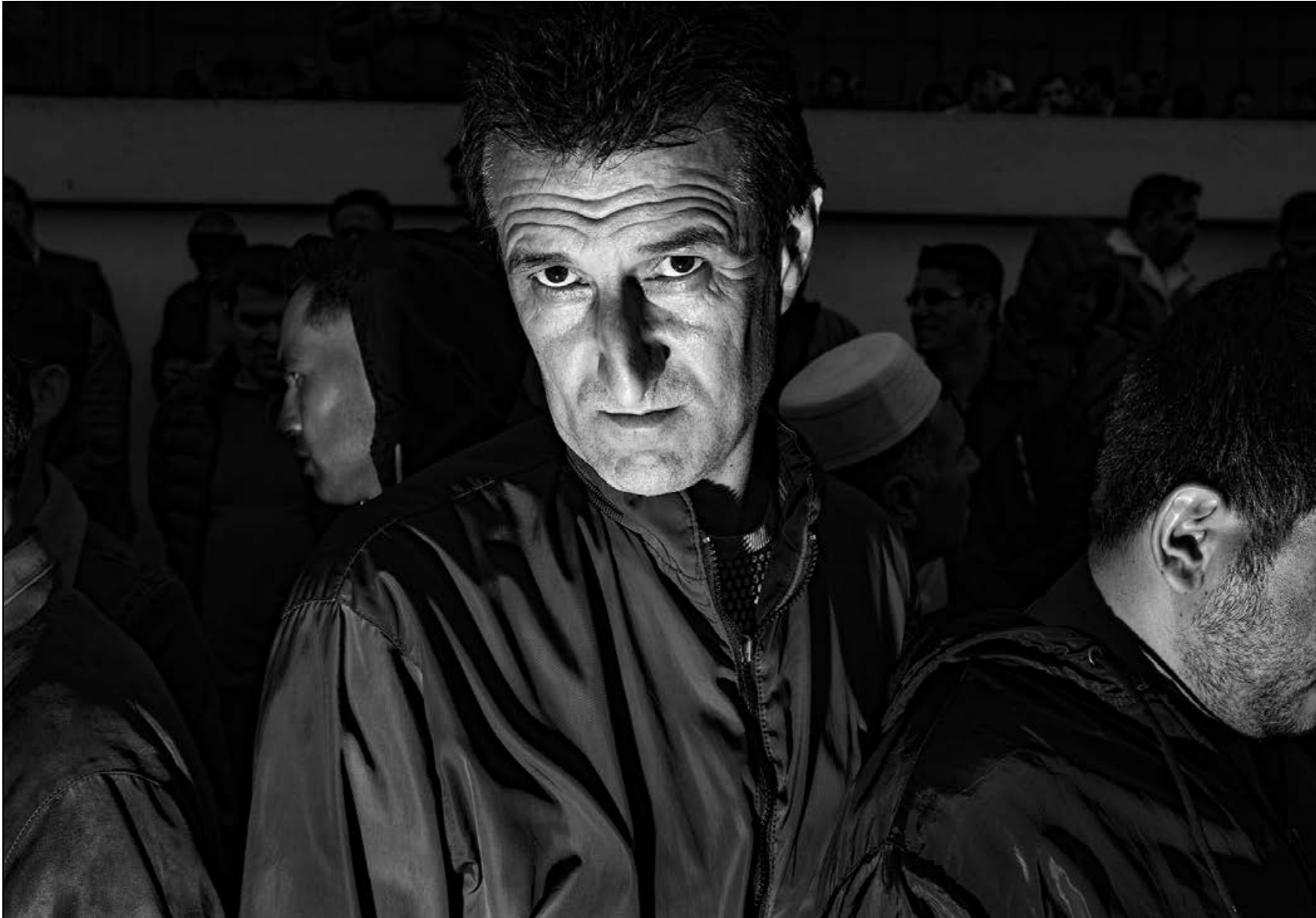
A guy into gambling shoots a glance at the camera amidst the horse racing events in Gonbad Kavous. Informal gambling is a kind of betting that's pretty widespread among Iranian gamblers traditionally.