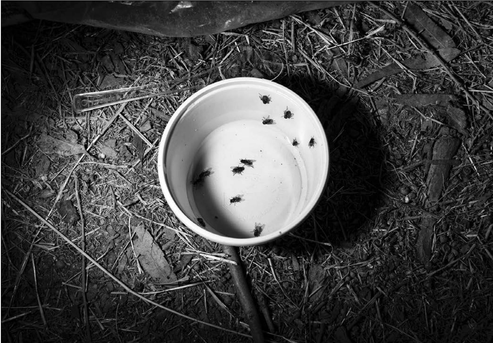
Ice cream container is seen during the Bandar Torkaman Horse racing course in 2023.