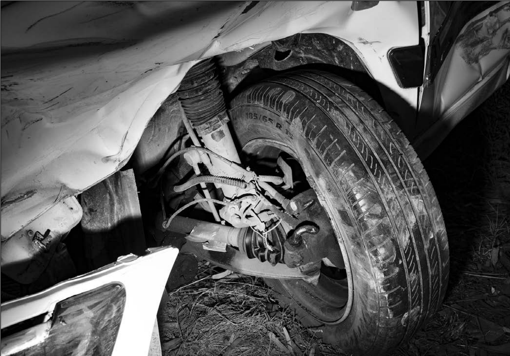
The car of a gambler is seen during the Bandar Torkaman Horse racing course in 2023.