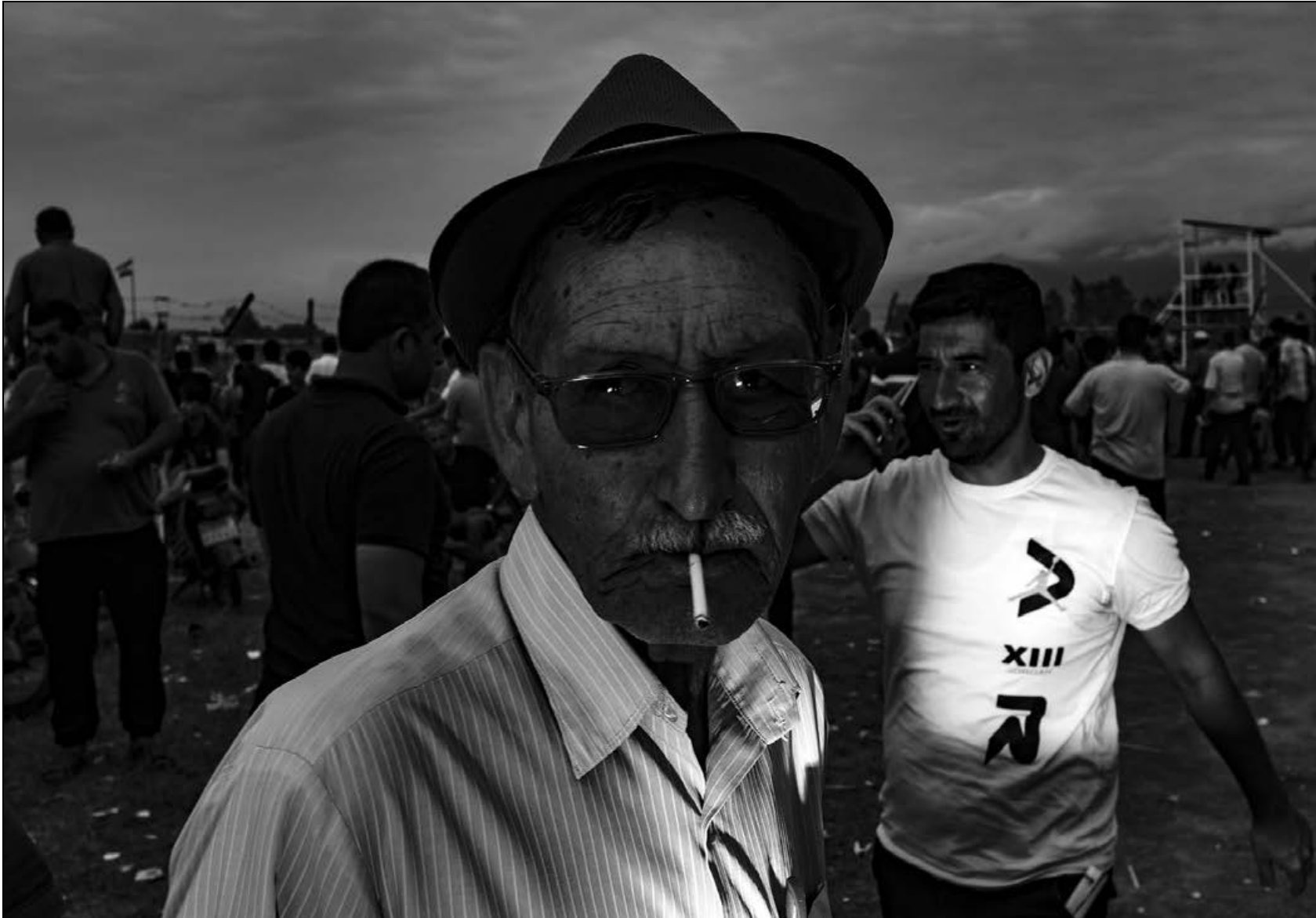
A bettor is seen during the Gonbad Kavous horse racing competitions.