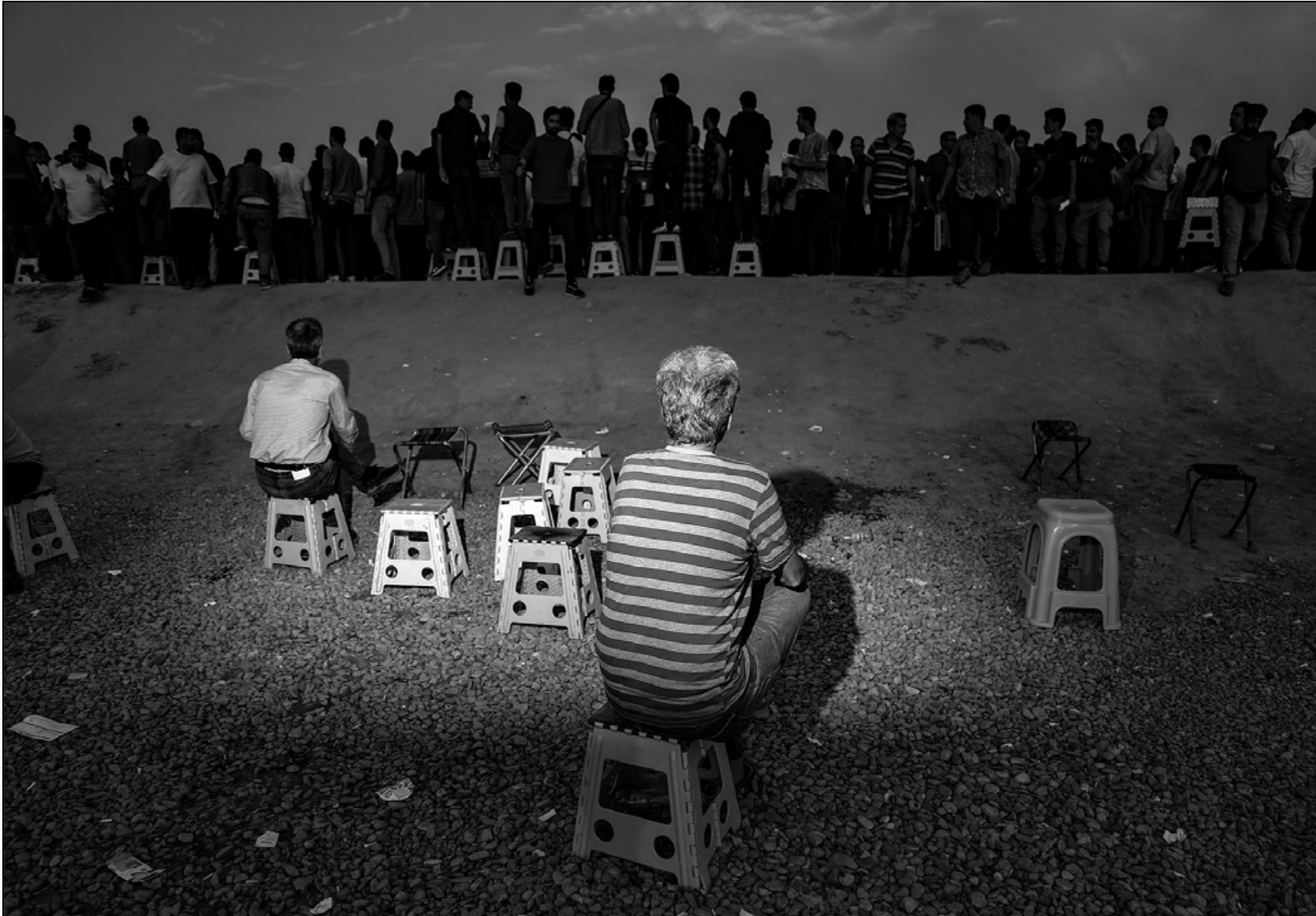
A bettor are seen in the horse racing events in Aq Qala,. Informal gambling is a kind of betting that's pretty widespread among Iranian gamblers traditionally.