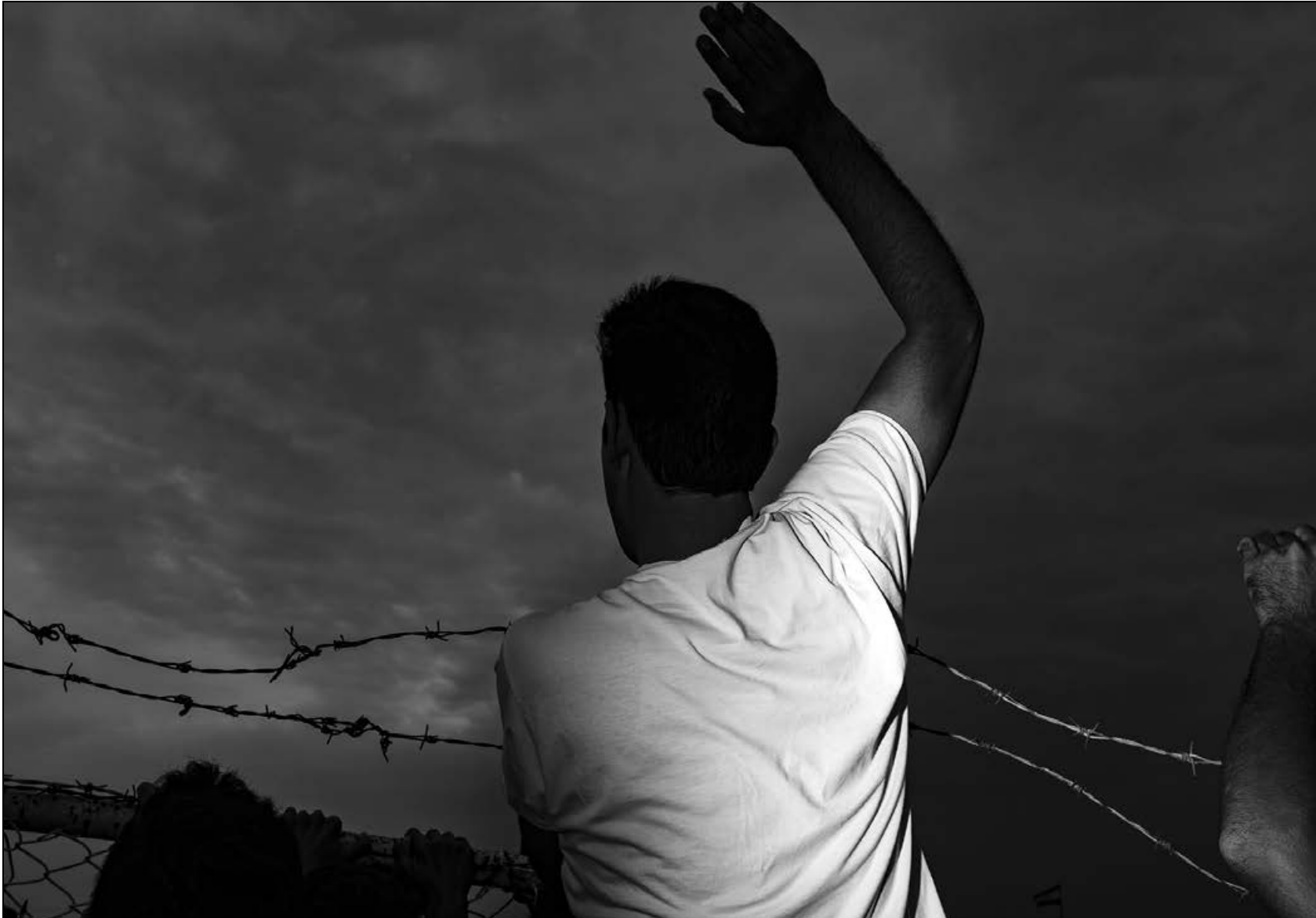
A bettor is seen during the Bandar Torkaman Horse racing course in 2023.