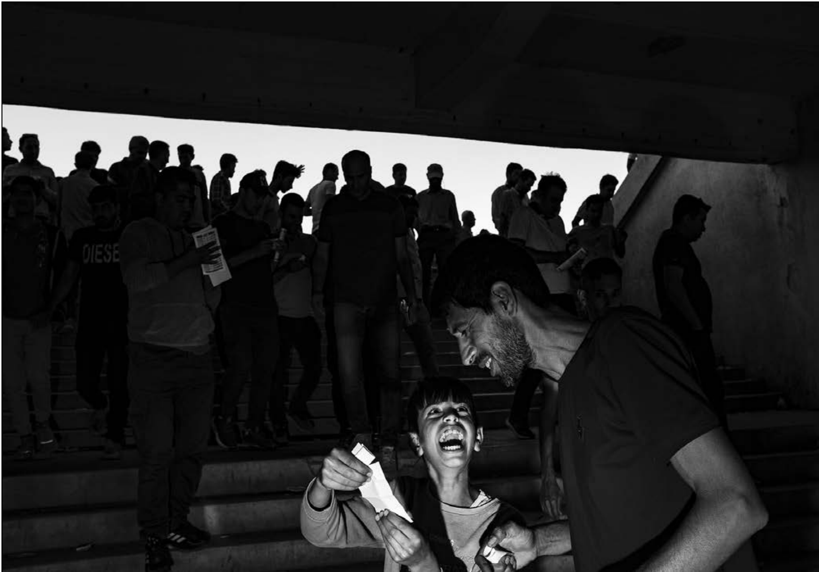
A boy, along with his father, is thrilled about their win in the betting of the Gonbad Kavous horse racing competitions. Fathers only permit their children to engage in Halal betting.