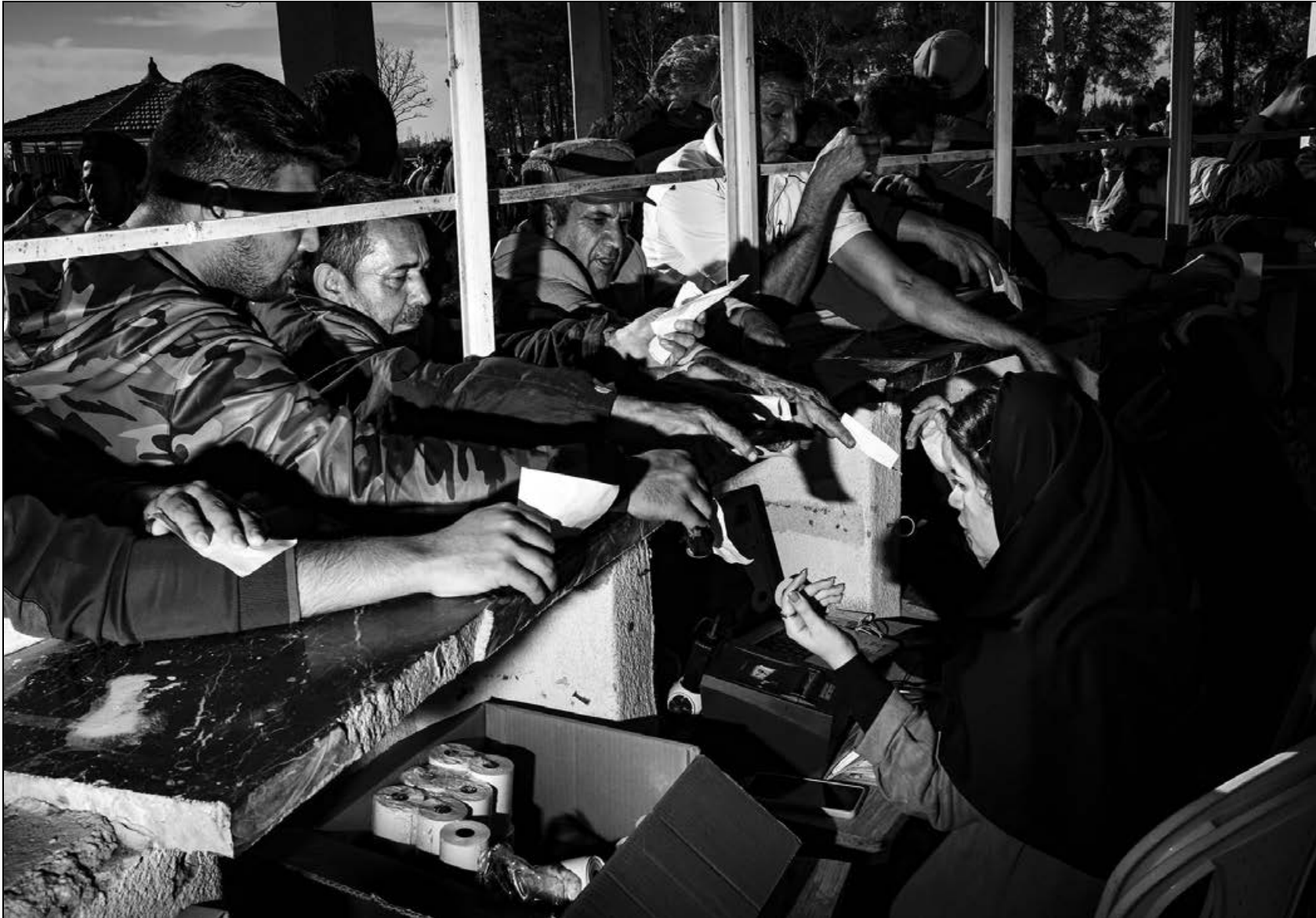
Bettors are cashing in on their bets by heading over to the booth linked to the horse races in Turkmen Port. This kind of betting is a unique Iranian flavor, known as 'Halal betting'.