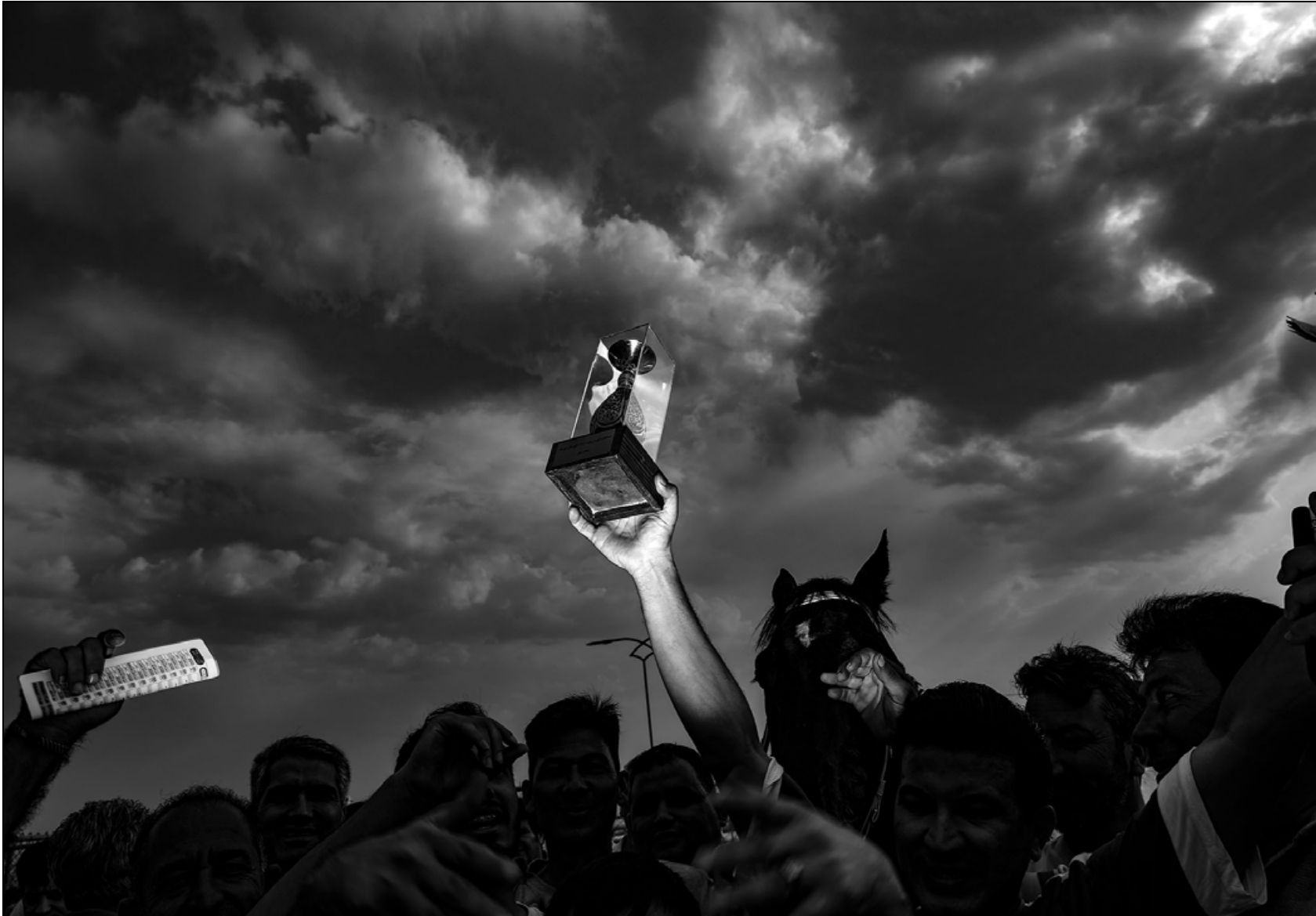
The joy of bettors alongside fans of the winning horse on October 17, 2024, during the horse racing event in Aq Qala, Golestan Province.