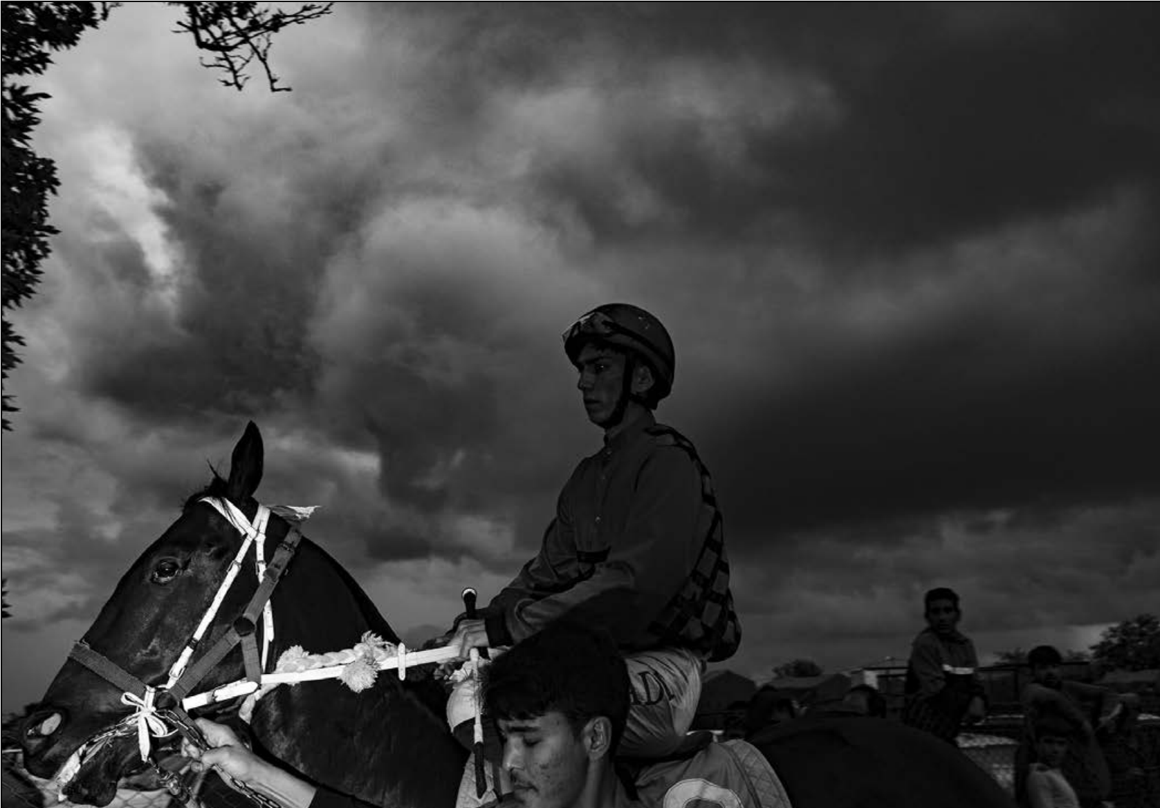
A rider is heading towards the Gonbad-e Kavus racecourse.