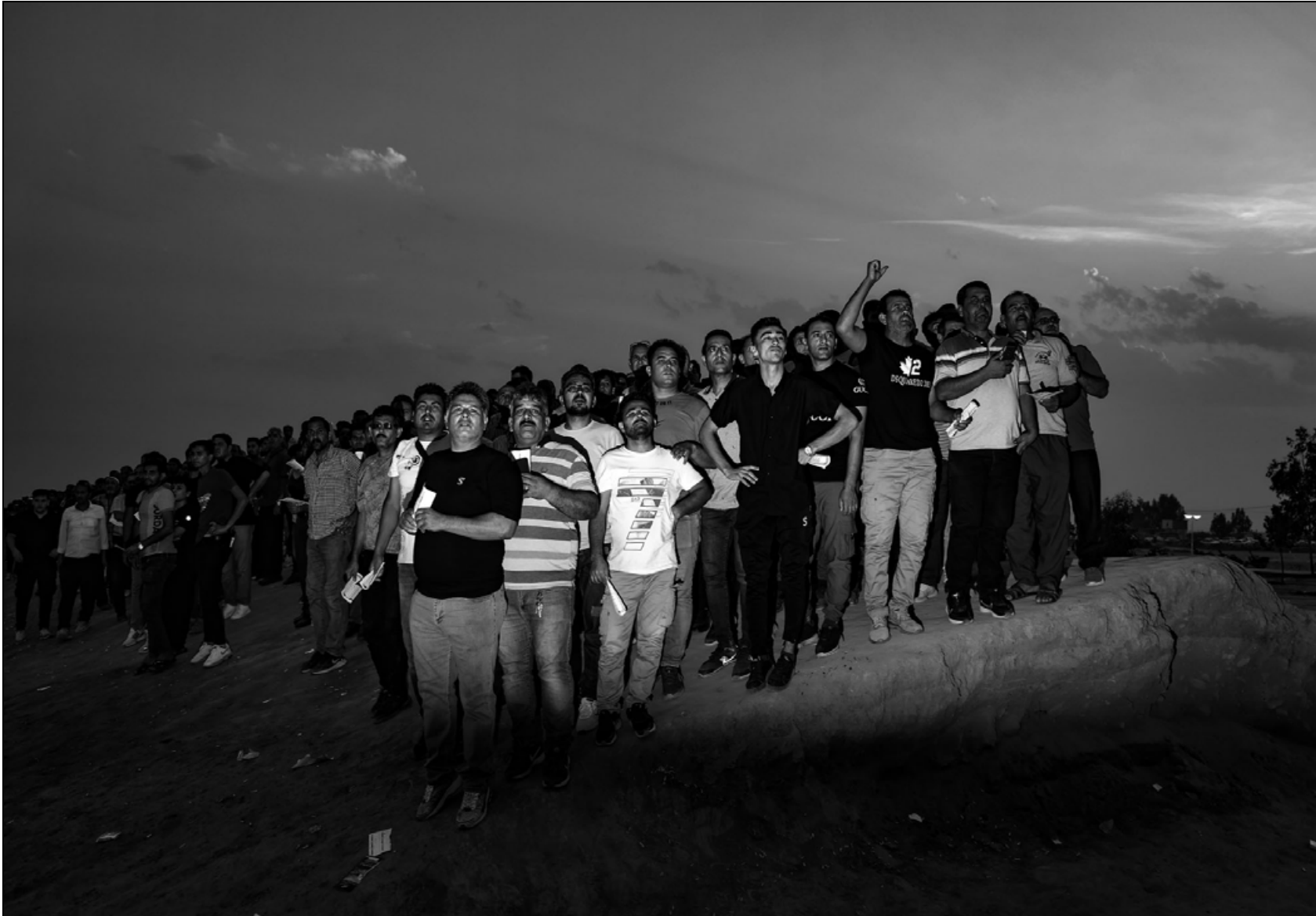
Official and unofficial gamblers standing on a hill during the horse racing event in Aq Qala, Golestan Province, on October 17, 2024.