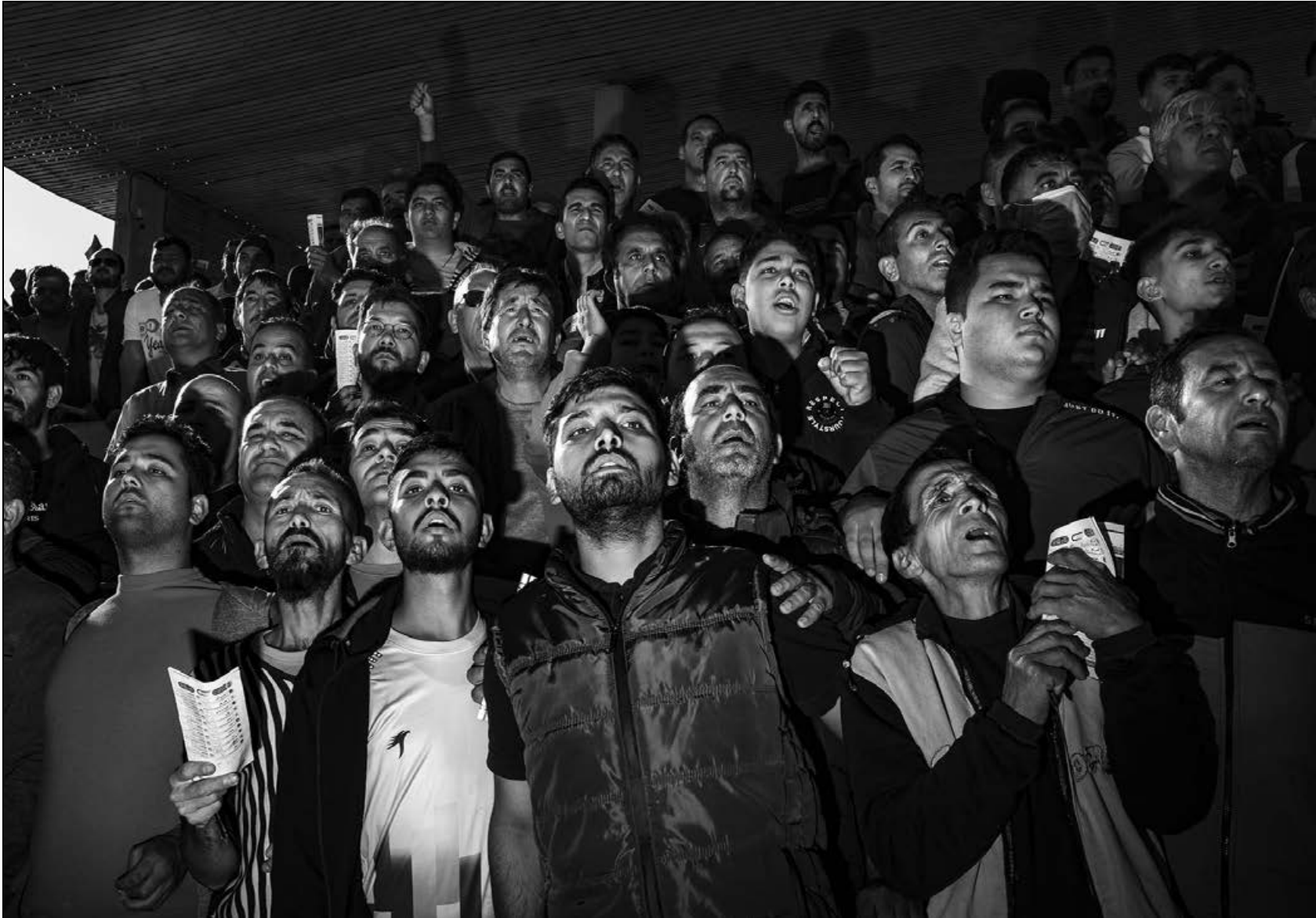
Official and informal gamblers at the sidelines of the horse racing competitions in Gonbad Kavous are seen at a designated spot for spectators.