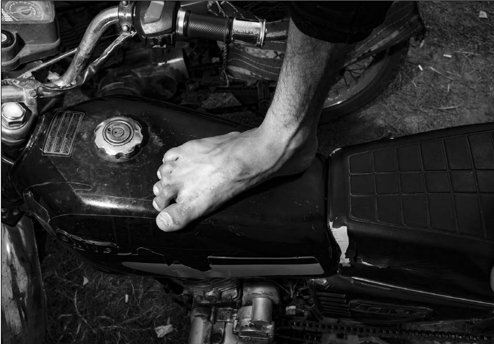
A leg of a bettor is seen during the Bandar Torkaman Horse racing course in 2023.