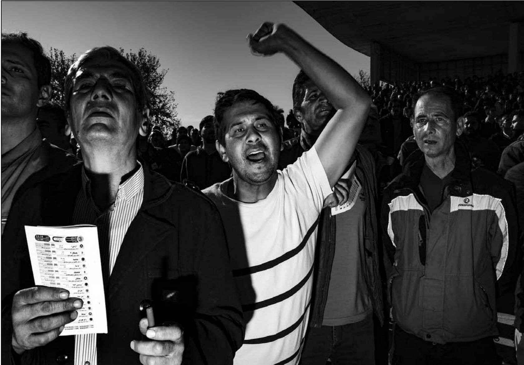
A bettor is cheering during the horse racing competitions in Gonbad Kavous. Official ticket sales are in place, but numerous Iranian gamblers lean towards informal betting among themselves.