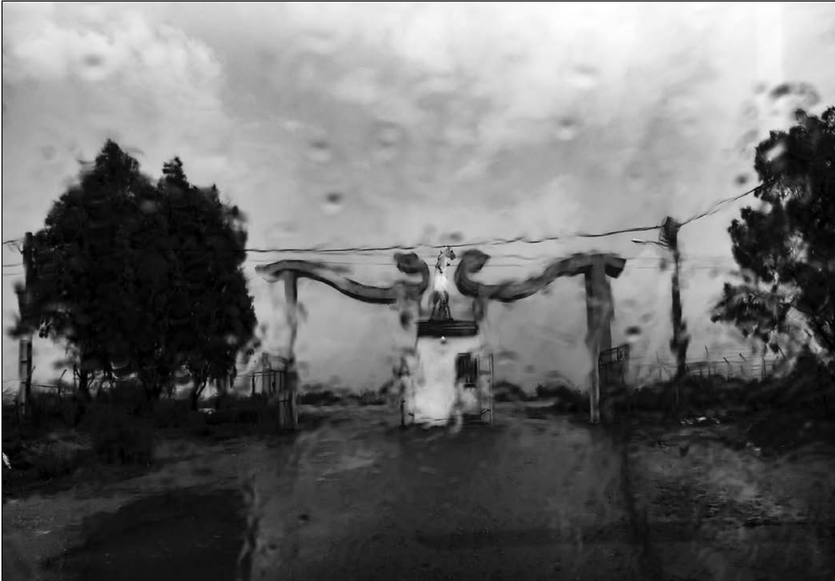
A view of the entrance to the Bandar-e Torkaman horse racing track on a day when the races were cancelled due to rain.