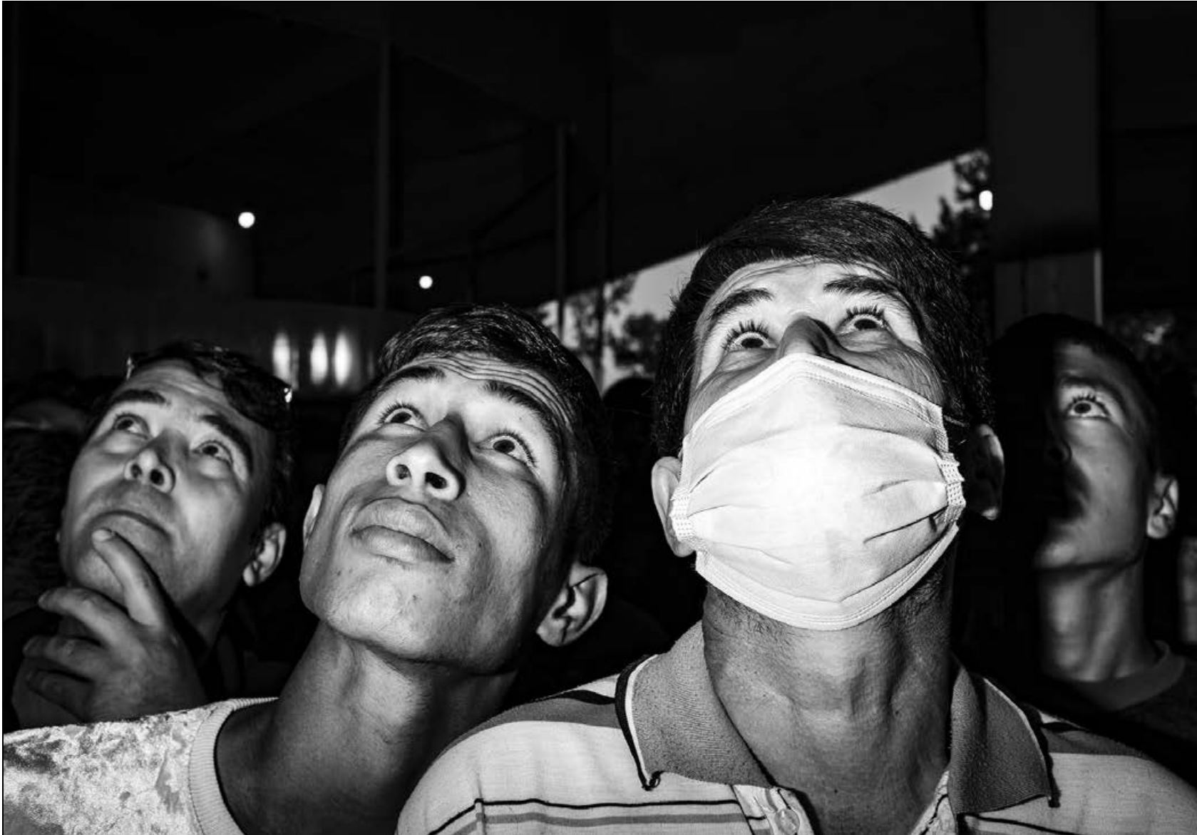
Bettors are checking out the monitors with info on horses and jockeys on the sidelines of the Gonbad Kavous horse races. Printed tickets and a lone monitor are the go-to for keeping gamblers in the loop at the prime spot for races in Iran.