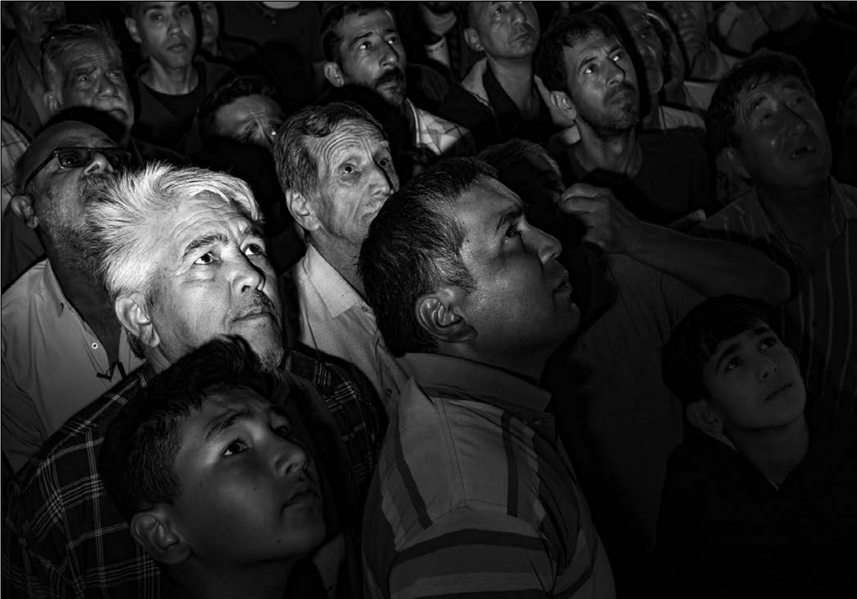
Bettors are checking out the monitors with info on horses and jockeys on the sidelines of the Gonbad Kavous horse races. Printed tickets and a lone monitor are the go-to for keeping gamblers in the loop at the prime spot for races in Iran.