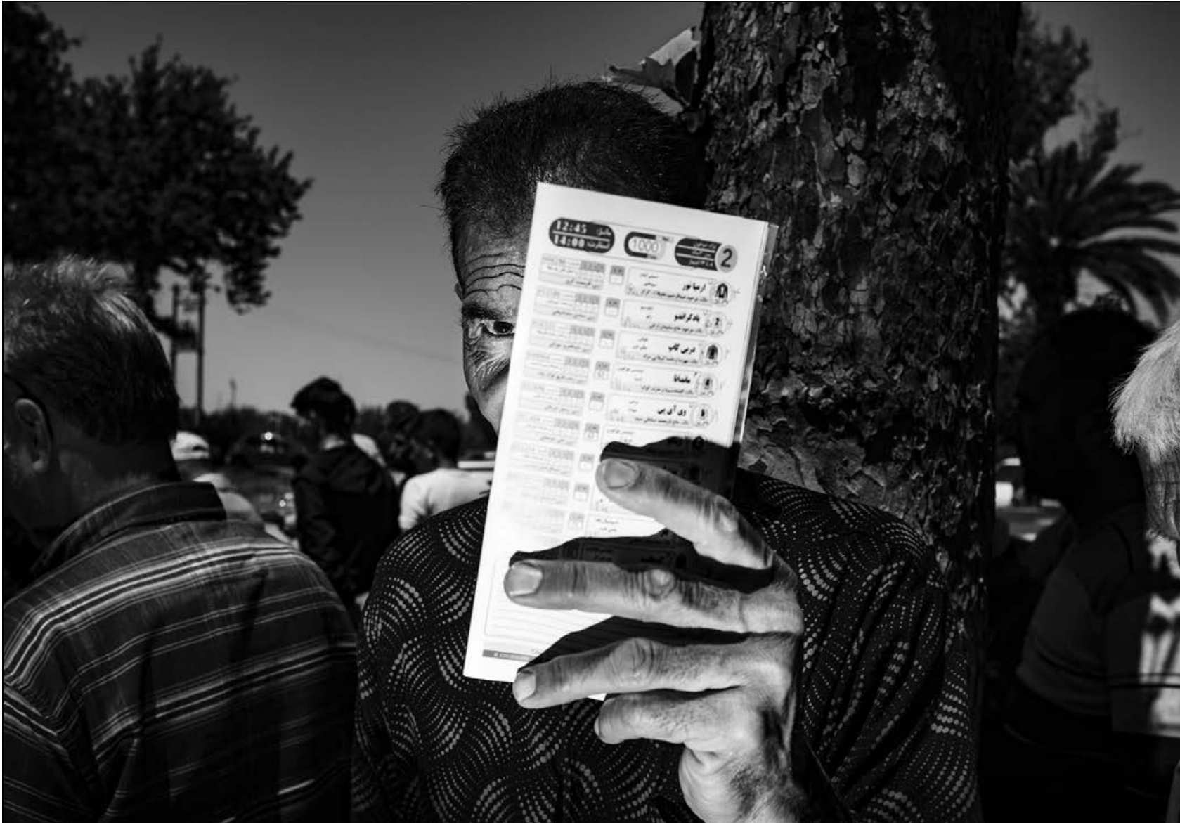
He shields his face from the photographer while placing bets. Gambling provides a fleeting escape from inner turmoil, such as depression, fear, and anxiety, shaping our perspective toward the unknown and threats.