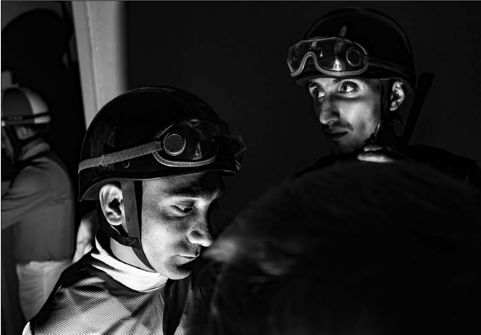
The jockeys at the horse racing track are getting ready for the summer races in Gonbad-e Kavus.