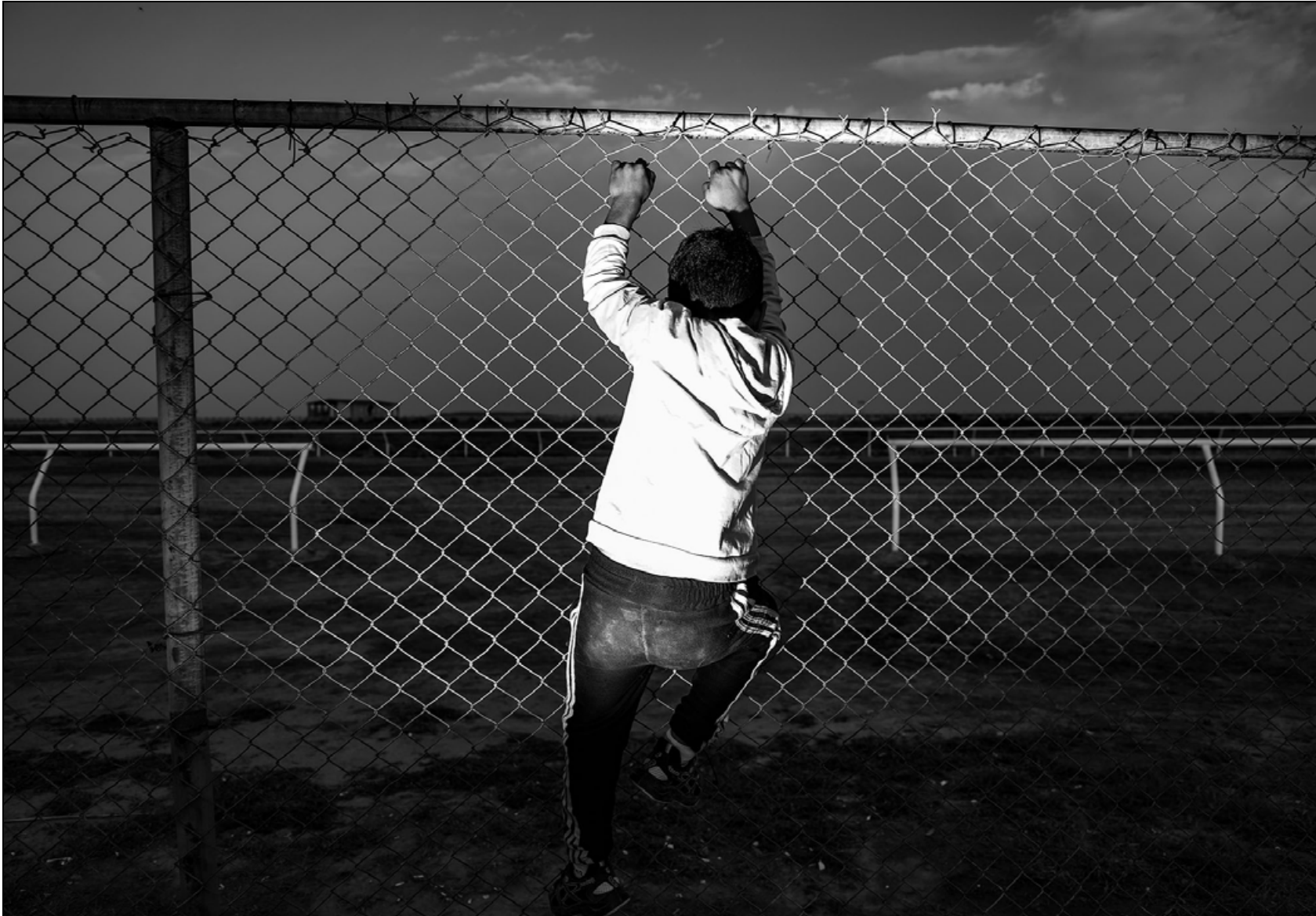
A boy is climbing over the fence of the Gonbad-e Kavus track before the races begin.