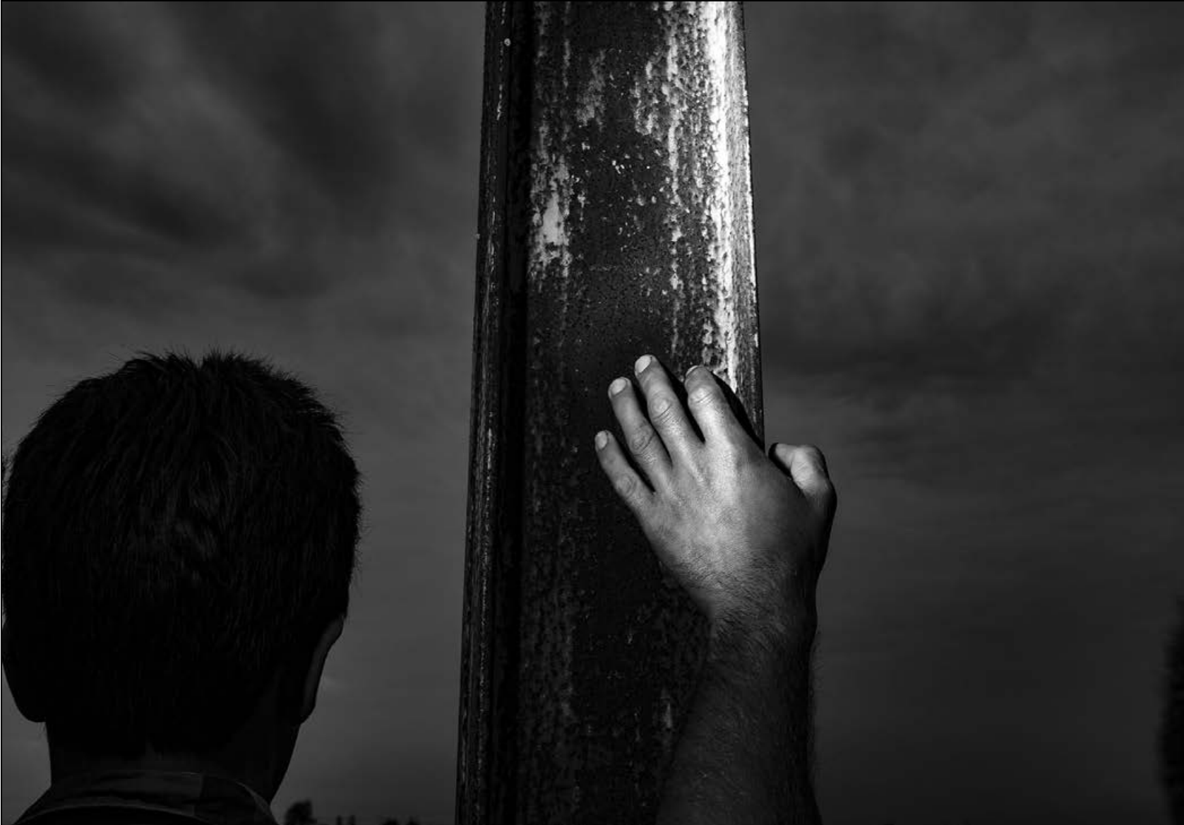
A hand of a bettor is seen during the Bandar Torkaman Horse racing course in 2023.