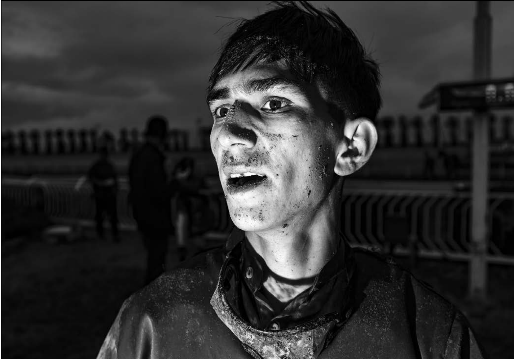
A horse rider is seen after the Gonbad-e Kavus Horse racing course in 2023.