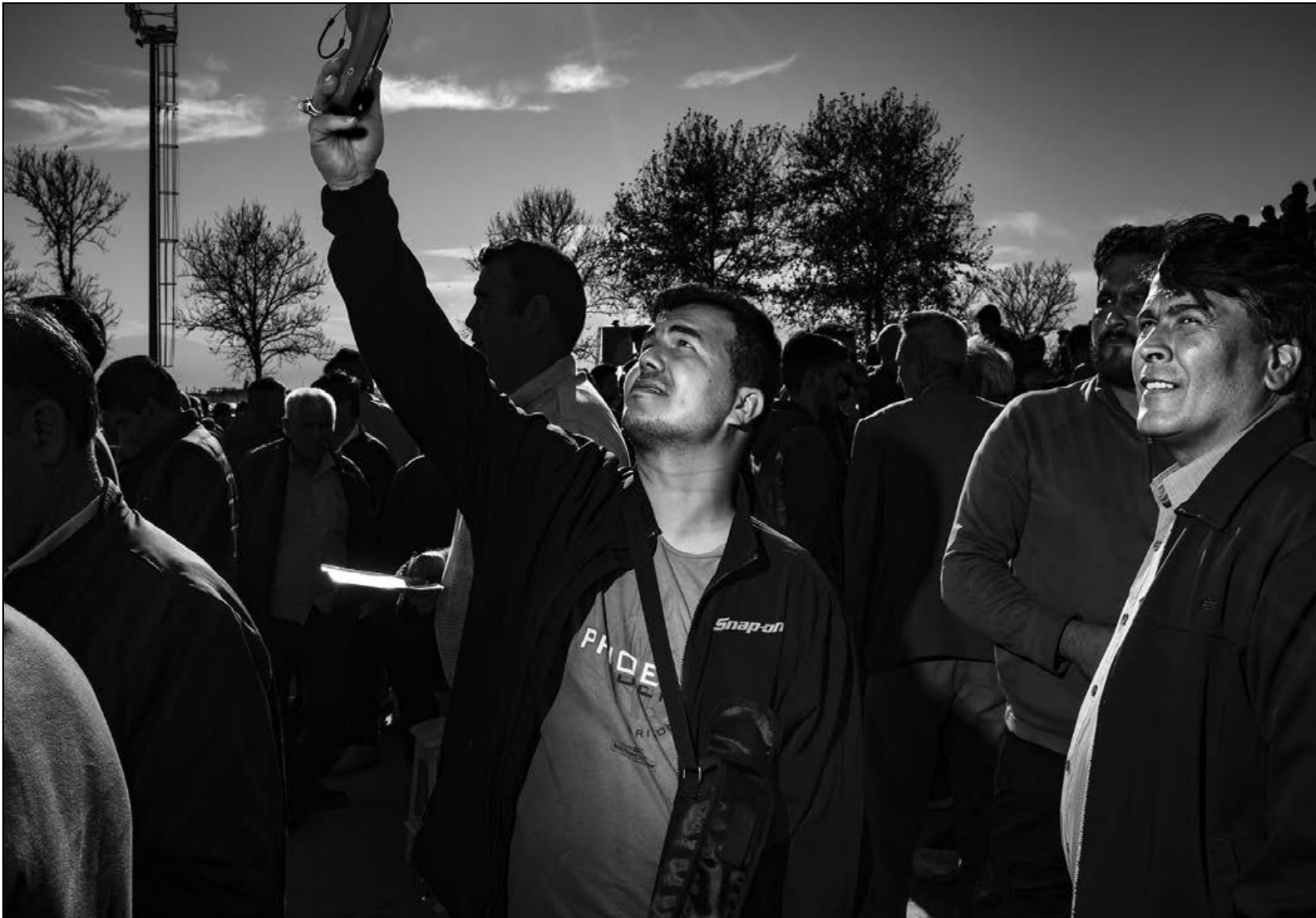
Gamblers are informally placing bets during the horse racing competitions in Gonbad Kavous. Official ticket sales are in place, but numerous Iranian gamblers lean towards informal betting among themselves.