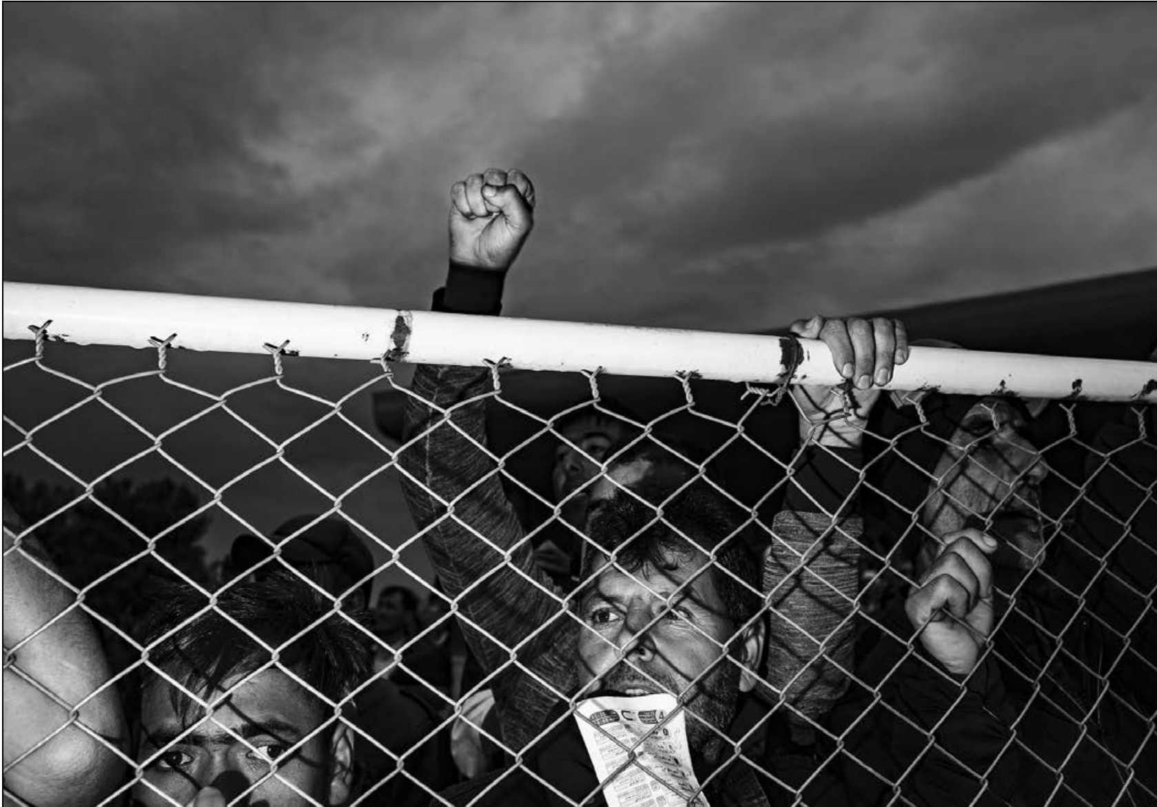
Official and informal gamblers at the sidelines of the horse racing competitions in Gonbad Kavous are seen at a designated spot for bettors. Gambling provides a fleeting escape from inner turmoil, such as depression, fear, and anxiety.