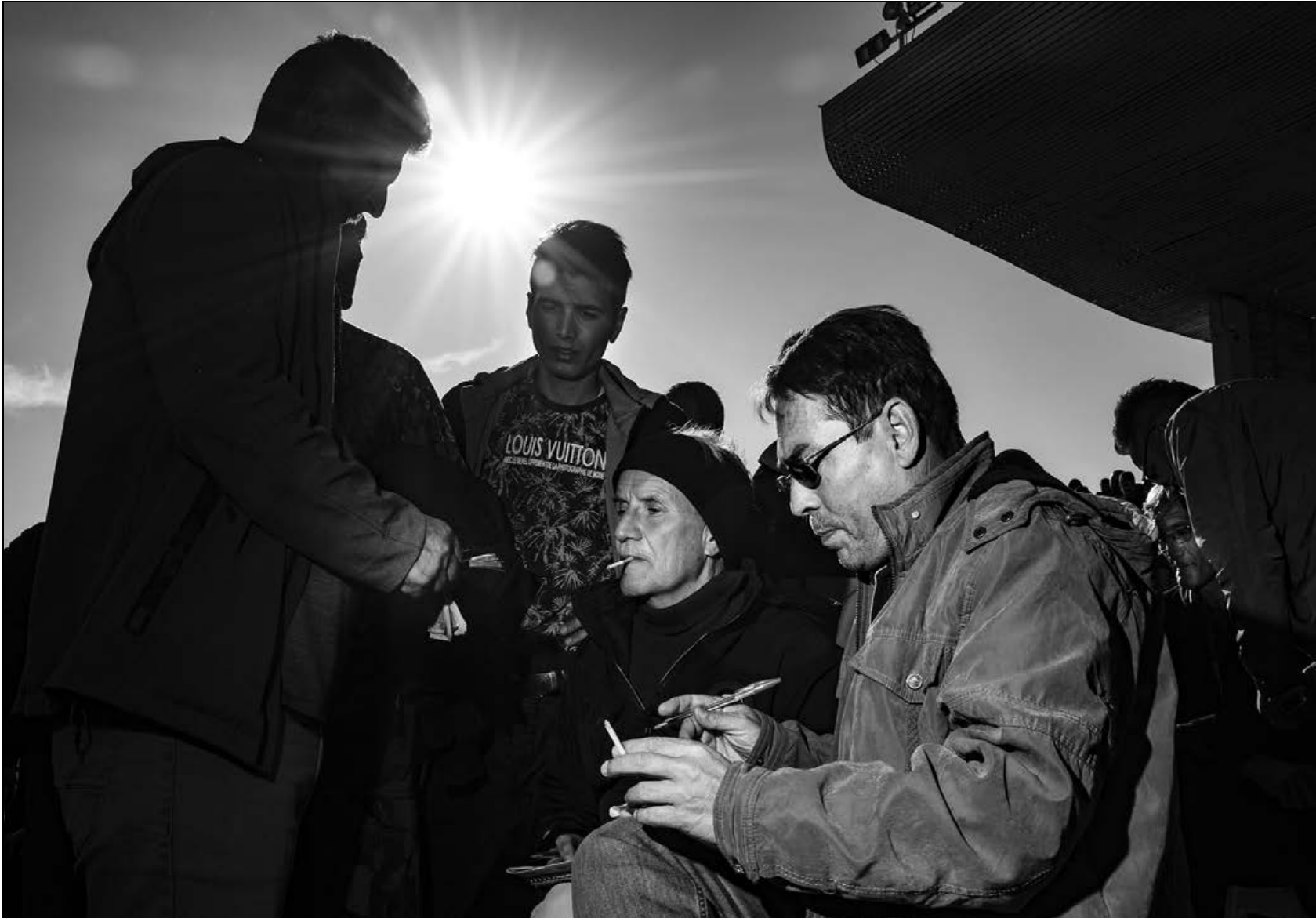
Gamblers are informally placing bets during the horse racing competitions in Gonbad Kavous. Official ticket sales are in place, but numerous Iranian gamblers lean towards informal betting among themselves.