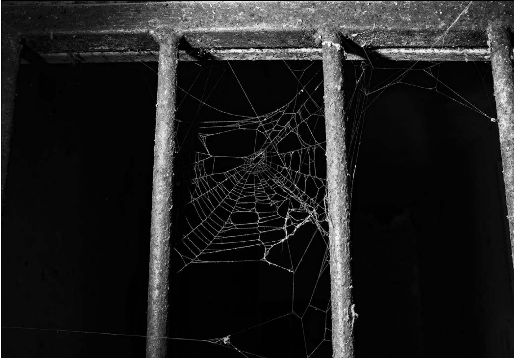
Spider web is seen during the Bandar Torkaman Horse racing course in 2023.