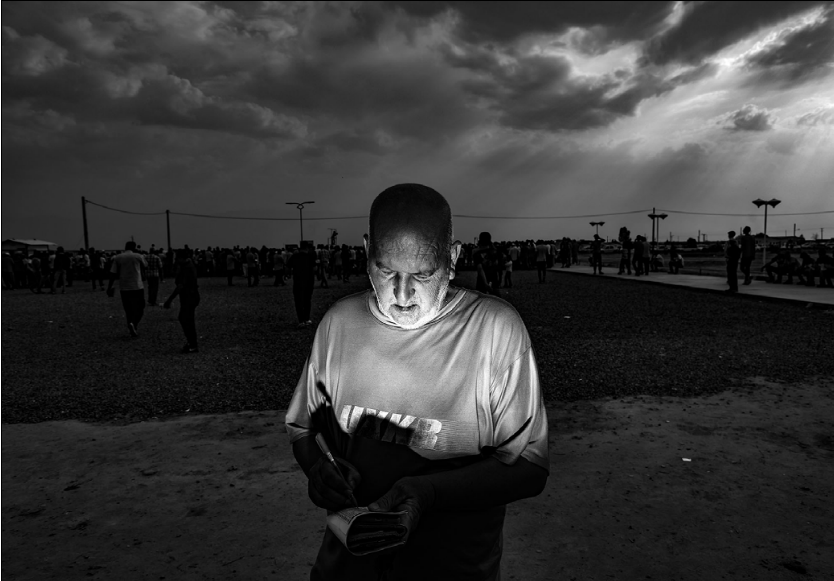
A bettor is seen in the horse racing events in Aq Qala. Informal gambling is a kind of betting that's pretty widespread among Iranian gamblers traditionally.