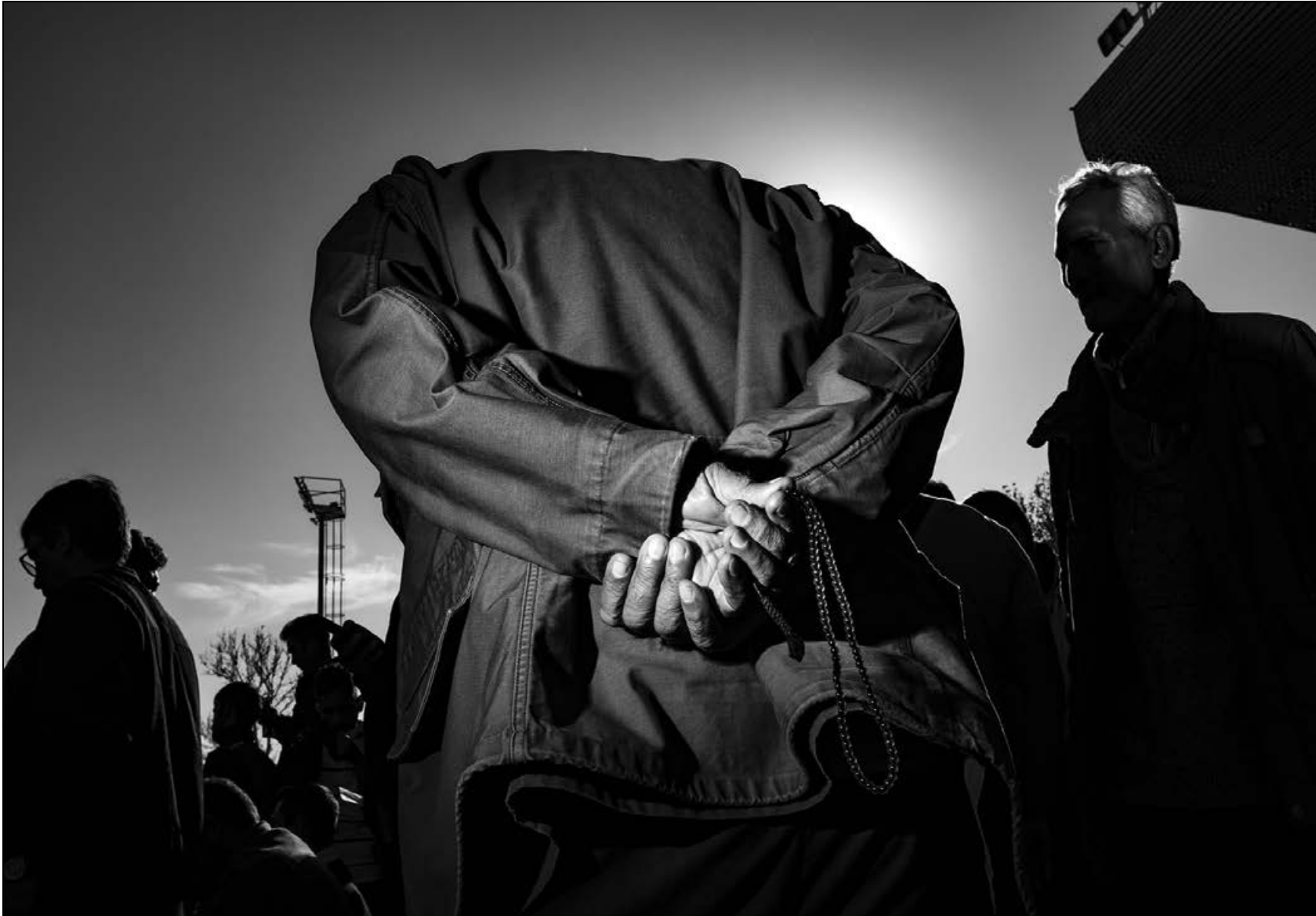
One of the gamblers is examining the participating horses during the horse racing event at Gonbad Kavus on December 22, 2023. Informal gambling is a kind of betting that's pretty widespread among Iranian gamblers traditionally.