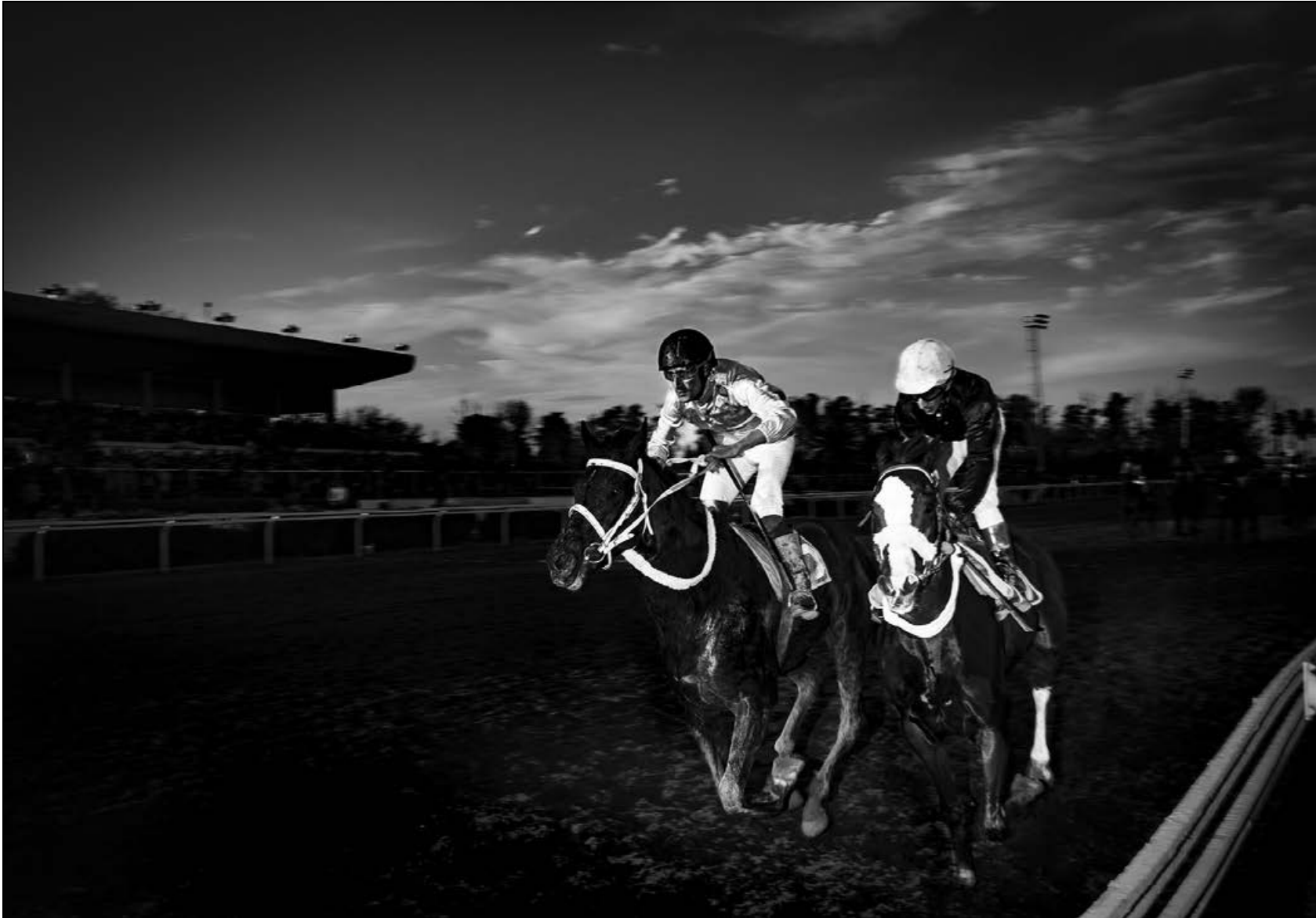
The Gonbad-e Kavus horse racing competition was held on December 22, 2023, at the Gonbad-e Kavus in Golestan Province.