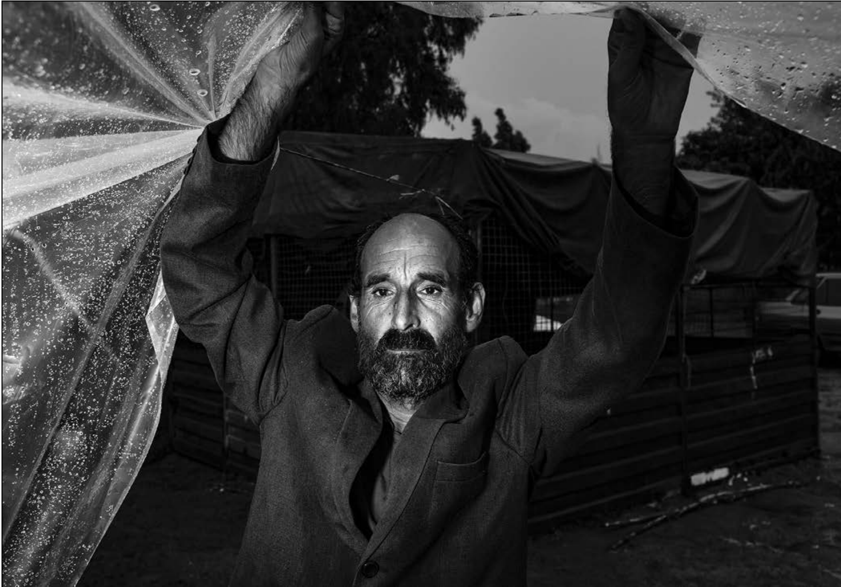
A male gambler is seen on the outskirts of the horse racing competitions in Bandar Torkaman, where the races were canceled due to rain.