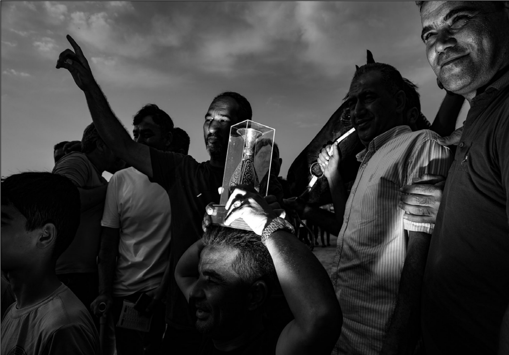
The joy of bettors alongside fans of the winning horse on October 17, 2024, during the horse racing event in Aq Qala, Golestan Province.