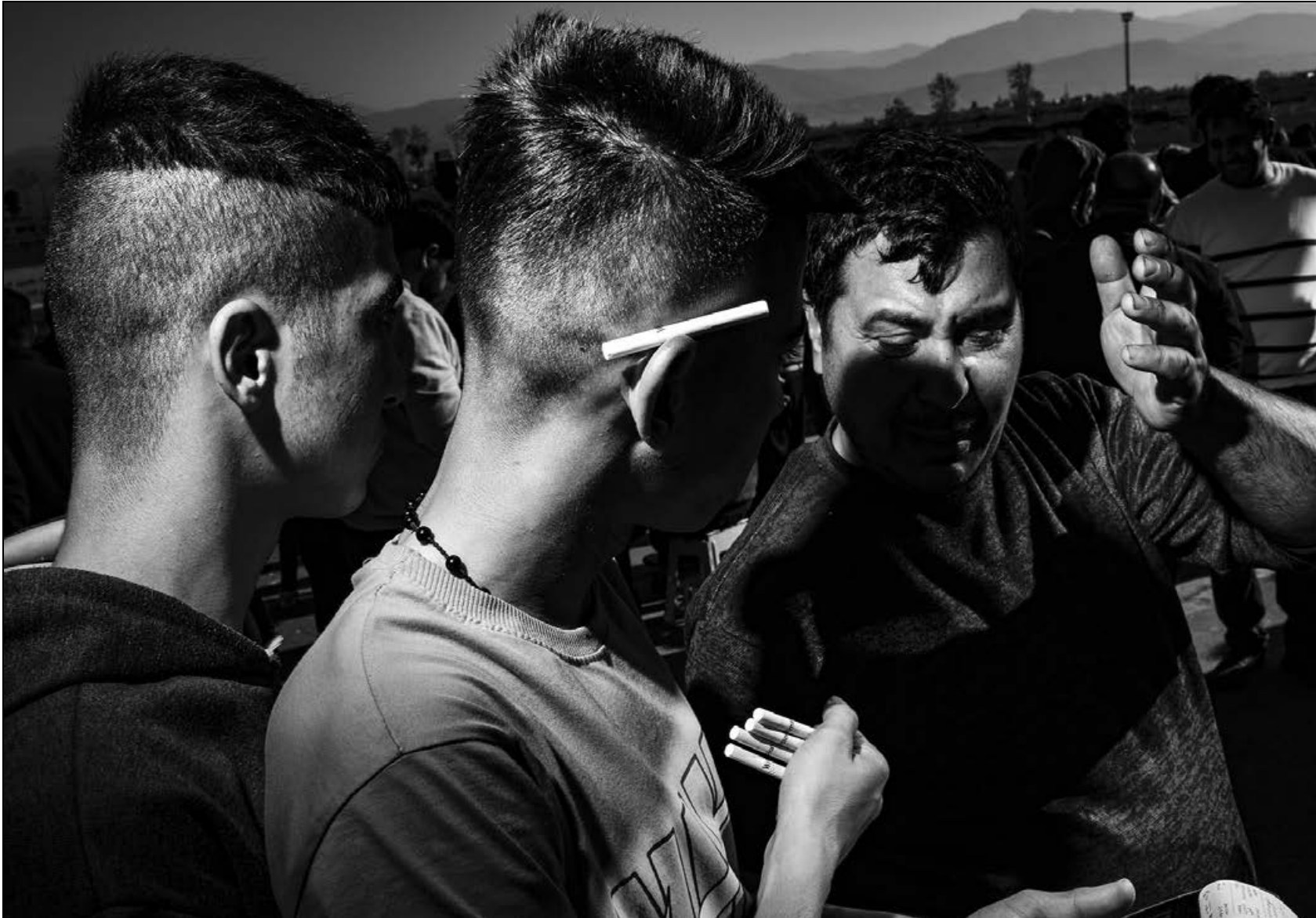
A few bettors are discussing betting before the horse racing competitions in Gonbad Kavous. In Iran, it's common for gamblers to traditionally place bets among themselves by exchanging cash on the horses before the races.