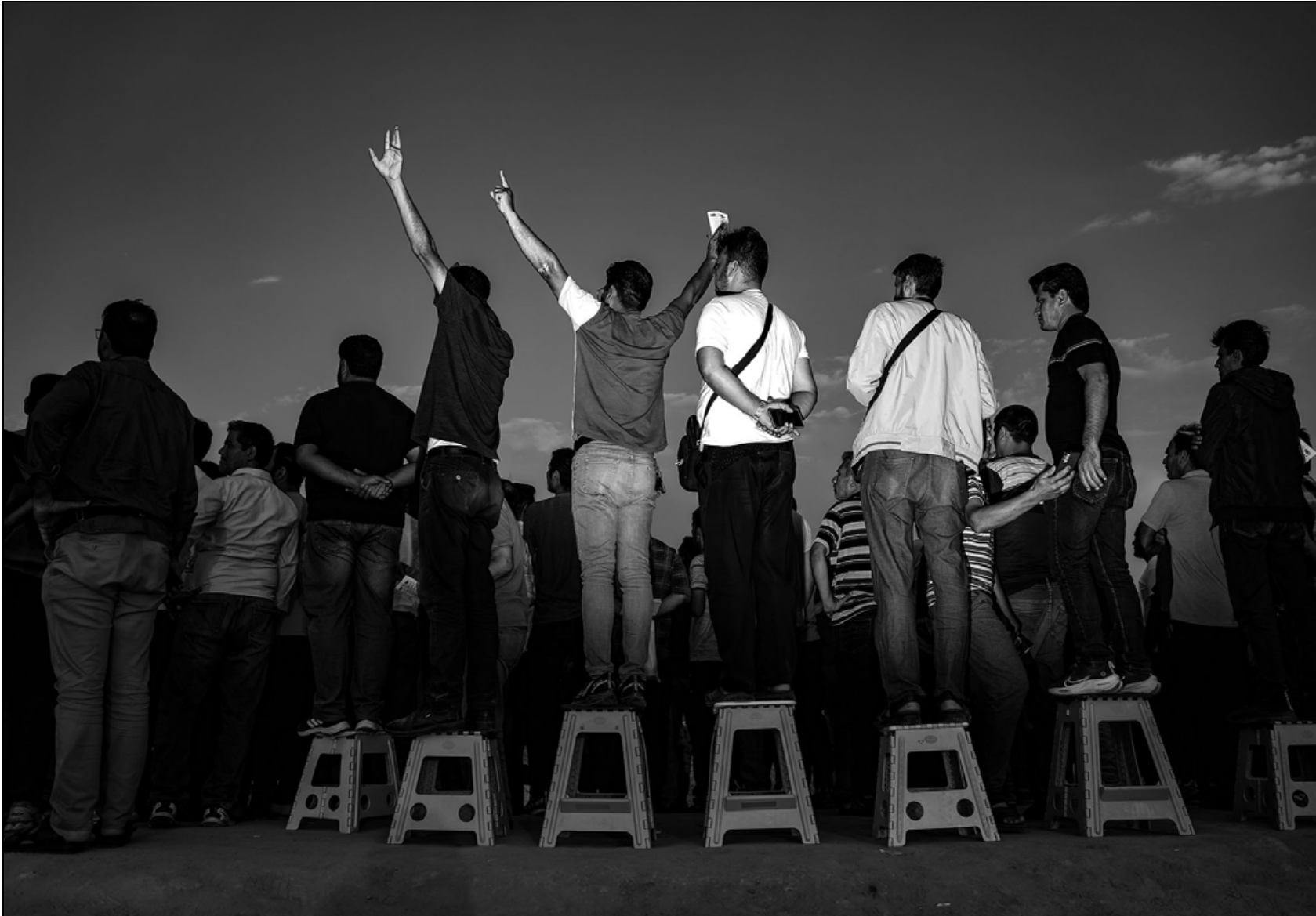
Bettors are seen during the horse racing event in Aq Qala, Golestan Province, on October 17, 2024.