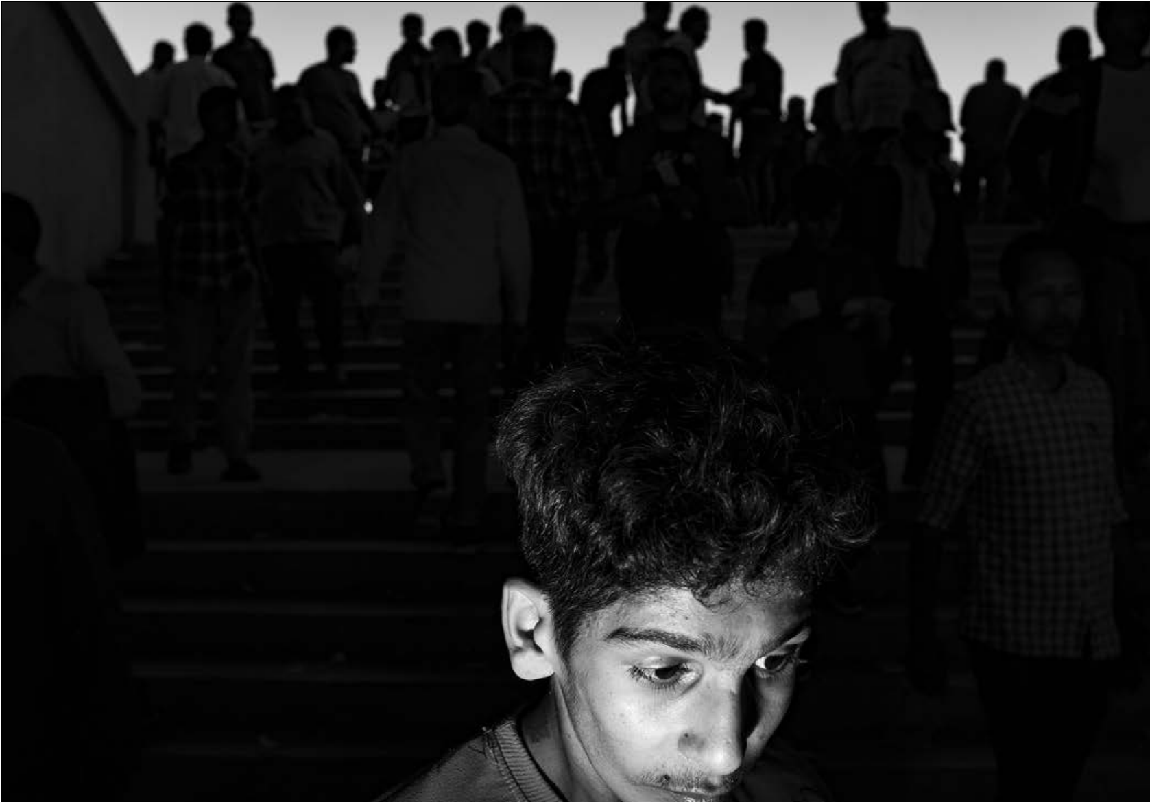
A bettor is seen during the Gonbad Kavous horse racing competitions.