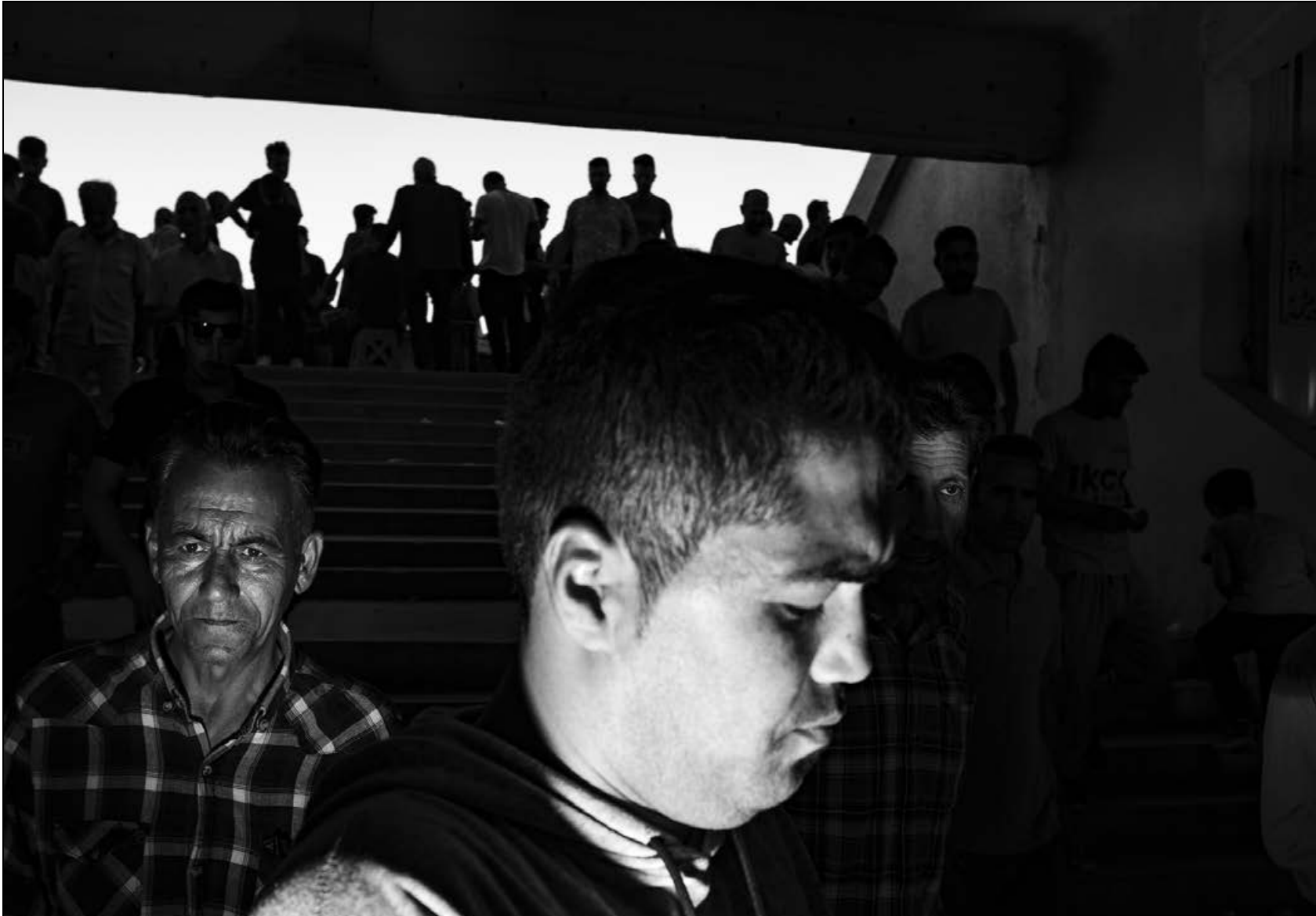
Bettors are seen during the Gonbad Kavous horse racing competitions.