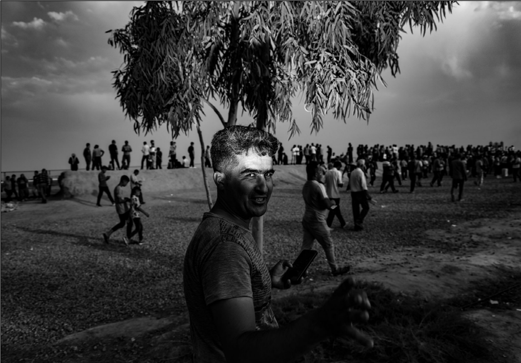
One of the bettors celebrating after the final round of the horse racing event in Aq Qala, Golestan Province, on October 17, 2024.